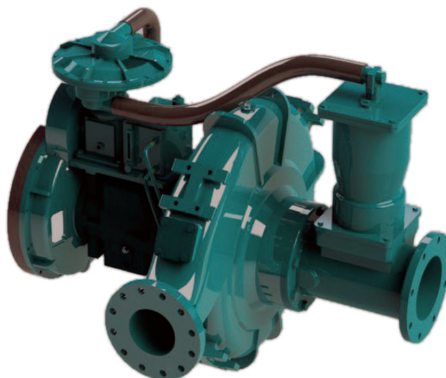
A typical picture of the pump is shown. Please contact Cornell Pump Company for further details. All information is approximate and for general guidance only.